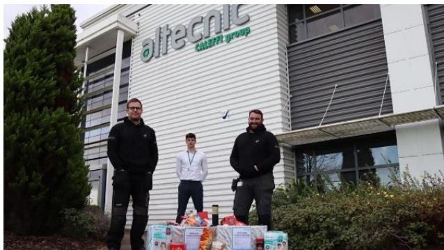
Altecnic staff with their first employee food collection

proud to be donating to Stoke-on-Trent Foodbank as a 21 for 2021 Business, pledging £1,000 alongside our regular food donations to ensure continued support for those in our local community."